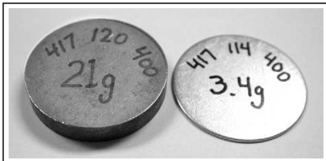
Photo shows the 2 different types of weight used in Bombardier Lite clutches.